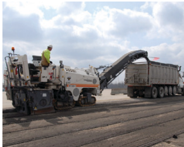
Milling machine milling asphalt road and loading debris into haul truck.

Respiratory protection is not required for work with small drivable milling machines (less than half-lane) regardless of task duration.